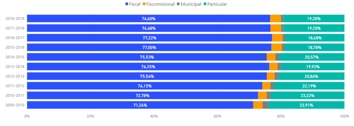
Figure 1. By period and sustenance.

EducarEcuador is an educative platform, for this reason various educational institutions do not use all its tools; however, it should be emphasized that all educational institutions use EducarEcuador platform to carry out the qualification process. Because of this, public institutions have had an increase in annual registration on the platform, see Figure 1.