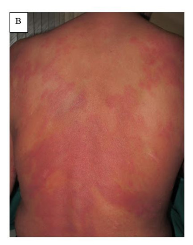
Figure 3. Comparison of skin manifestations in the same body region. (a) Presentation of skin lesions corresponding to granuloma annulare. Courtesy of the image: Actas Dermo-Sifiliográficas; (b) Presentation of skin lesions corresponding to mycosis fungoides. Courtesy of the image: Dermapixel blog, available at: https://www.dermapixel.com/2021/03/micosis-fungoide-hongos-solo-en-el.html.